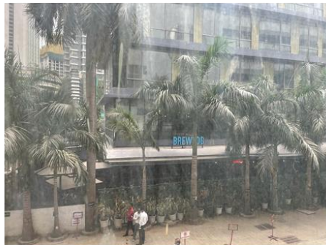
View from Units