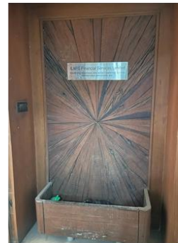
Units Main Entrance